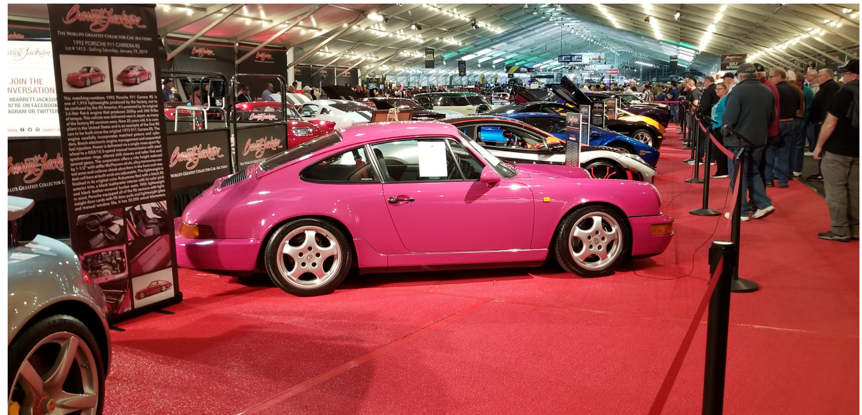
A Porsche up for bidding. Is that a Porsche color?