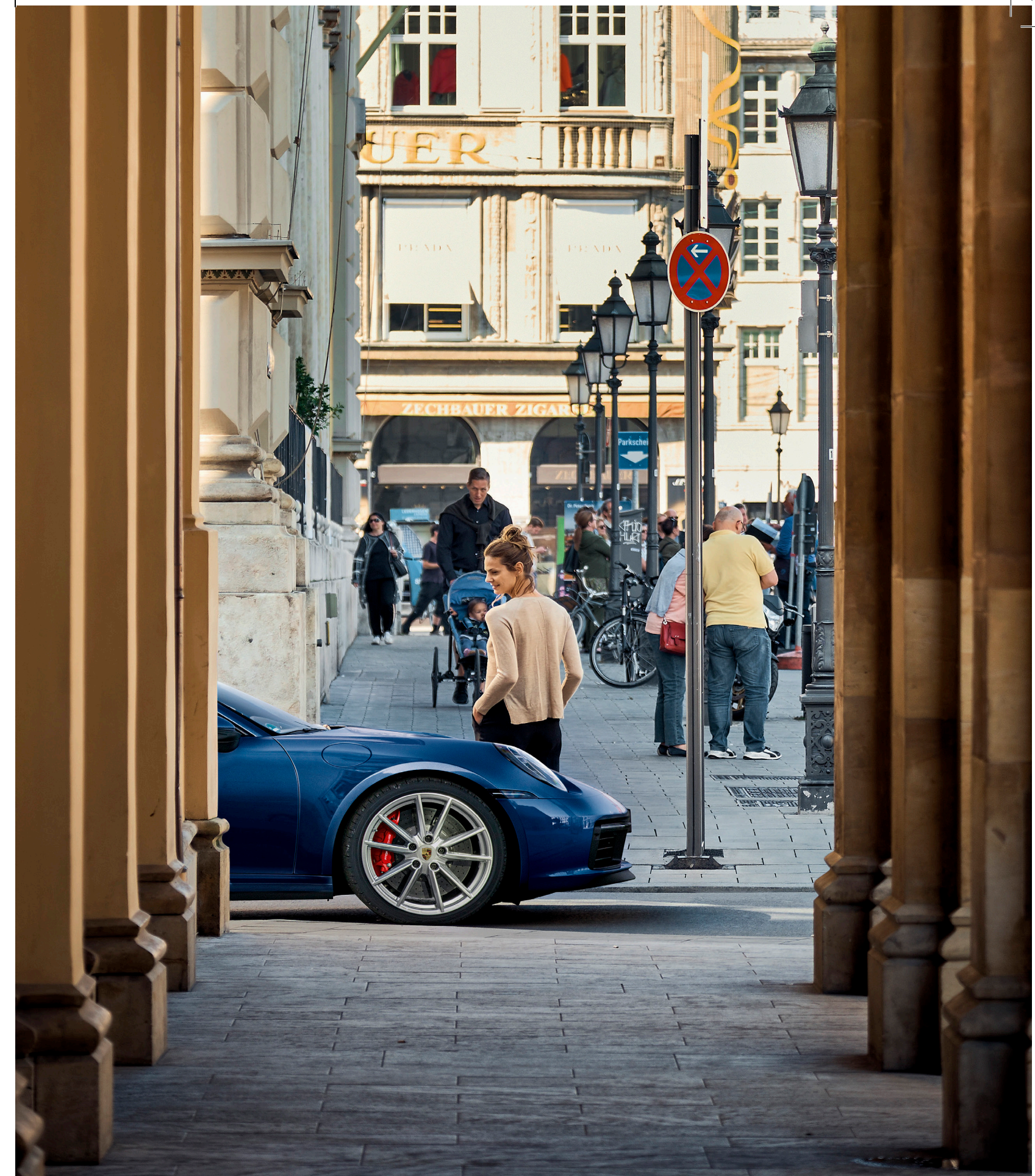
Is the 992 the most beautiful 911 ever built? Probably.

Oh Lord, won't you let me please pass the whole pack. We're lined up in staging and I'm way in back. With _____, _____, and _____ all watching their tach Oh Lord, won't you let me please pass the whole pack.