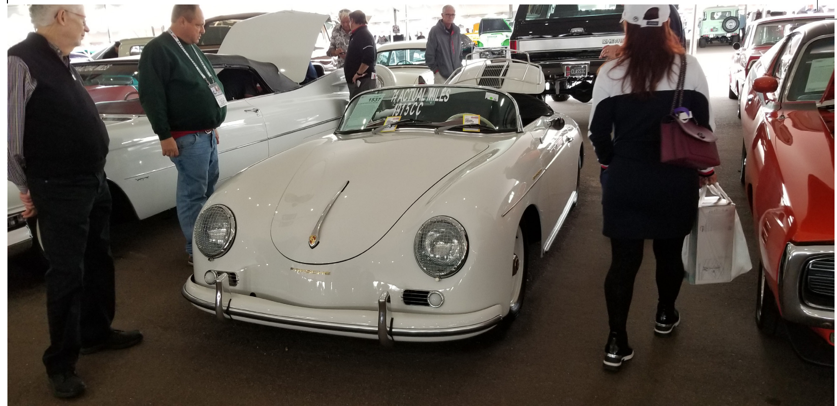
A kit Porsche Spyder. It went for big bucks.

Bottom line is that you simply have to experience this for yourself. We have Barrett-Jackson doing a Northeast Show June 26 – 29 at Mohegan Sun in Connecticut this year. When the time grows near, look for the "docket" online where you can review photos and descriptions of every vehicle offered. Hope to see you there.