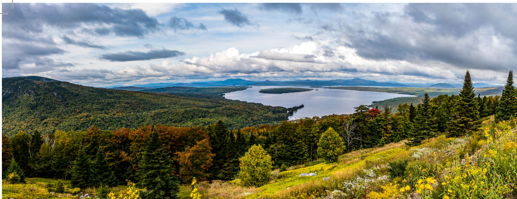
Overlooking Lake Mooselookmegantic, ME, NCR Fall Get-A-Way Weekend 2017.